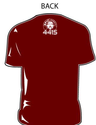
Back design about 3.5 wide