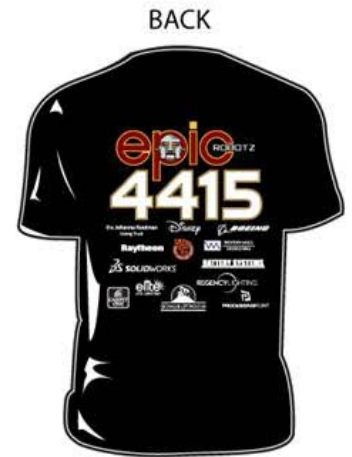
Back design about 11.5" wide.