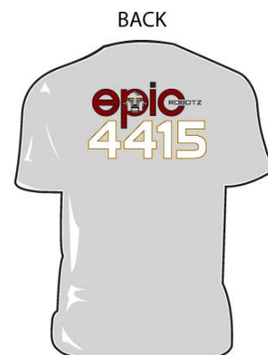
Back design about 11.5" wide in center.