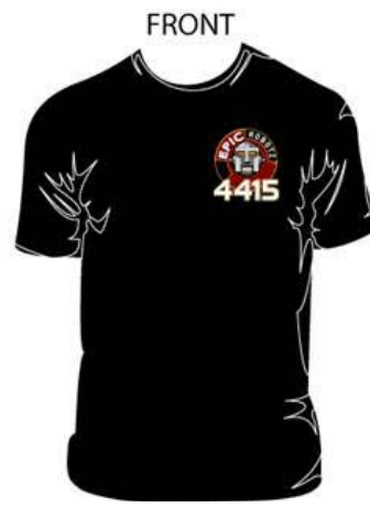
Front design about 4" wide on left chest.

Back: Team logo Version C is centered with sponsor logos underneath in white with the VCHS logo as the exception.