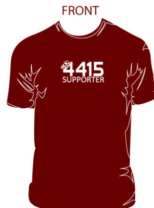
Front design about 6.5" wide on left chest

Front: Team logo Version E centered on the front and Version A centered on the top of the back.