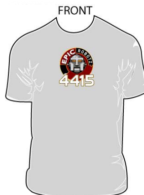
Front design about 6" wide in center.

Team sponsors are not printed on these shirts.